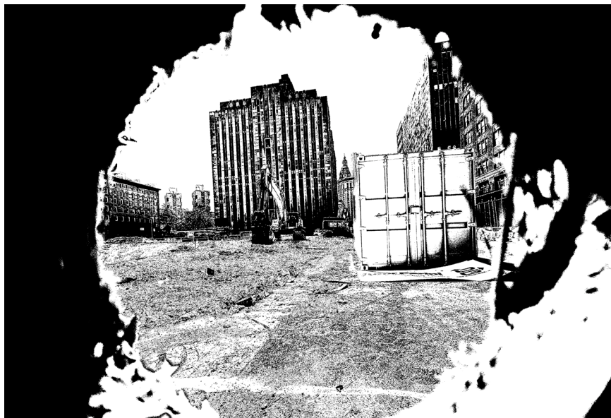
Paul Pfeiffer, Perspective Study , 2026 Reference perspective of the construction site on 124–125 Walker St.