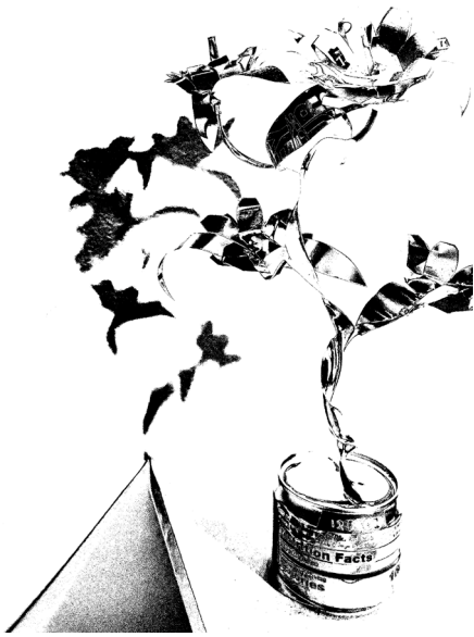
Canal Street Research Association, Can Flower , 2026